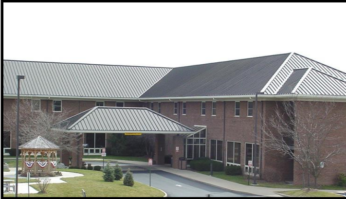
Thomson-Hood Veterans Center, Wilmore, KY 156/285, 55%