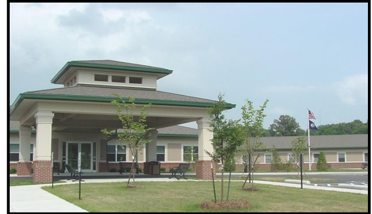
Western Kentucky Veterans Center, Hanson, KY 88/156, 56%