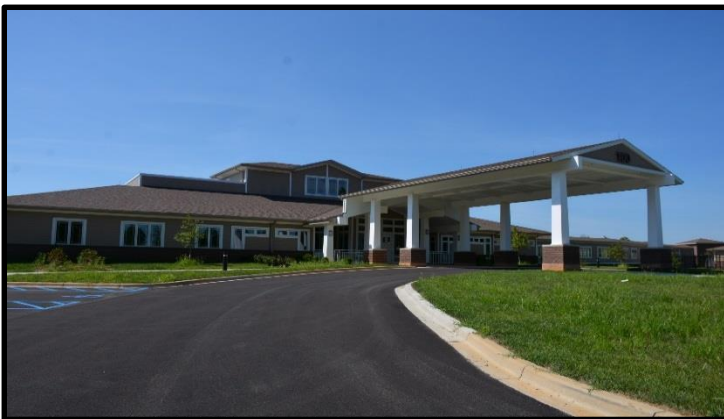
Radcliff Veterans Center, Radcliff, KY 59/120 49%