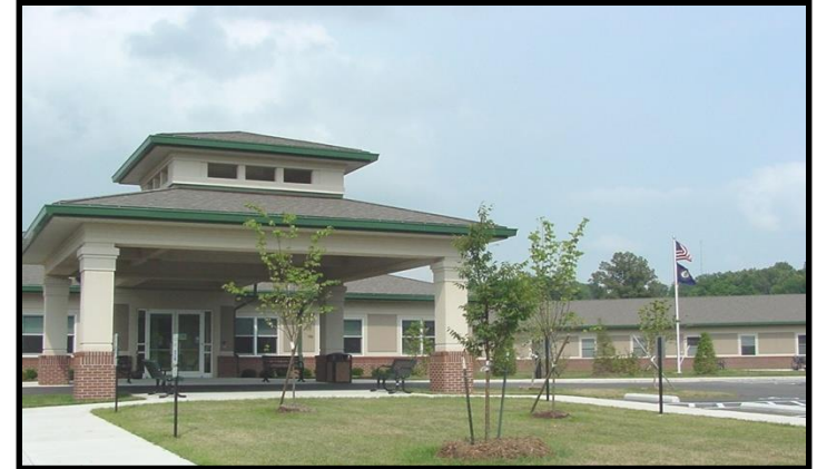
Western Kentucky Veterans Center, Hanson, KY 85/156 55%