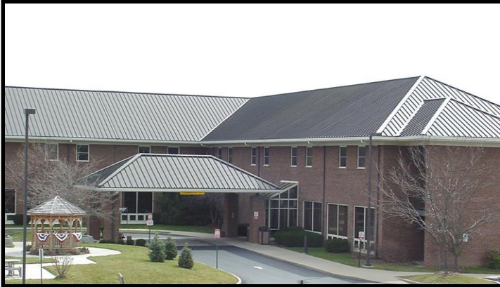
Thomson-Hood Veterans Center, Wilmore, KY 154/285 54%