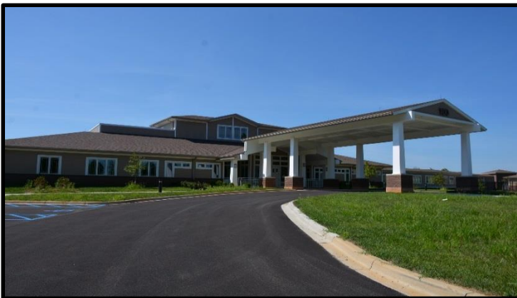
Radcliff Veterans Center, Radcliff KY 52/120 43%