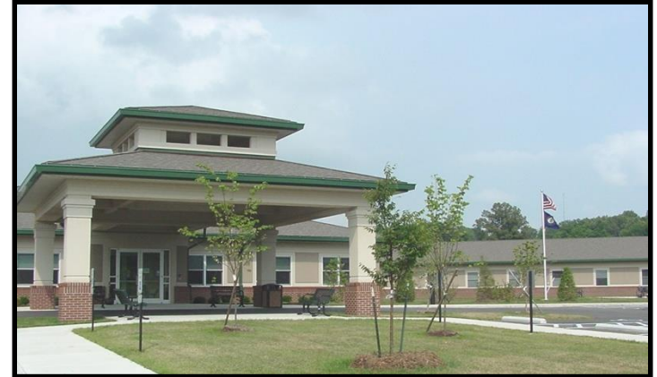
Western Kentucky Veterans Center, Hanson, KY 87/156 56%