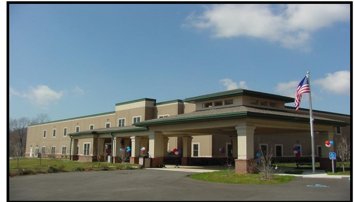
Eastern Kentucky Veterans Center, Hazard, KY 106/120 Beds 88%