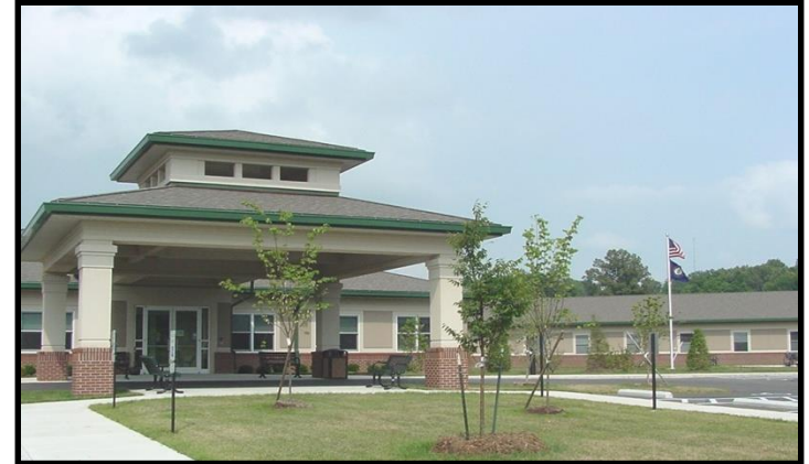
Western Kentucky Veterans Center, Hanson, KY 87/156 Beds 56%