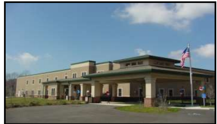
Eastern Kentucky Veterans Center, Hazard, KY 109/120 Beds 92%