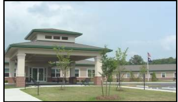
Western Kentucky Veterans Center, Hanson, KY 87/156 Beds 56%