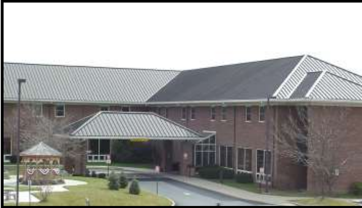
Thomson-Hood Veterans Center, Wilmore, KY 156/285 Beds 55%