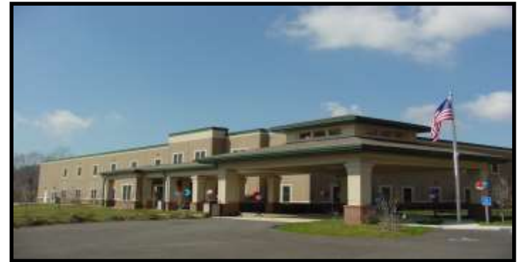
Eastern Kentucky Veterans Center, Hazard KY 120 Beds