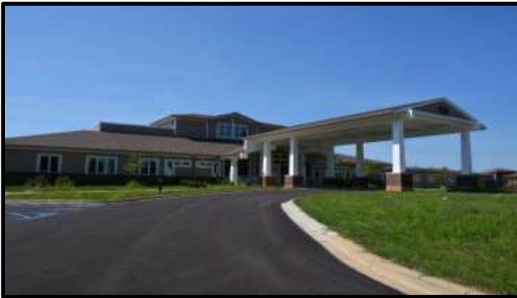
Radcliff Veterans Center, Radcliff KY 120 Beds