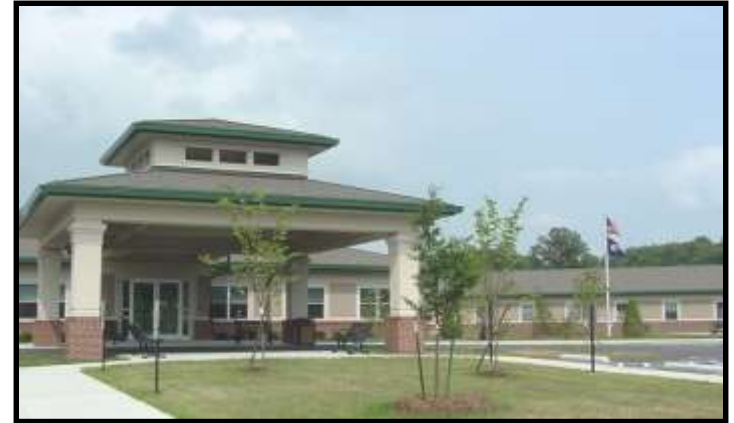
Western Kentucky Veterans Center, Hanson, KY 156 Beds