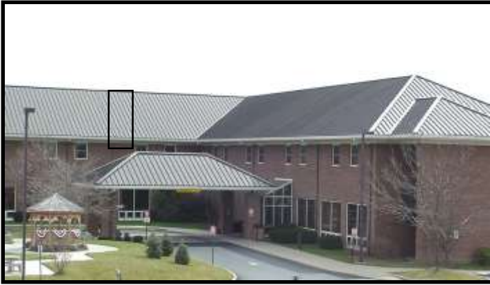
Thomson-Hood Veterans Center, Wilmore, KY 285 Beds