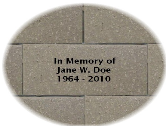
Sample Memorial Paver