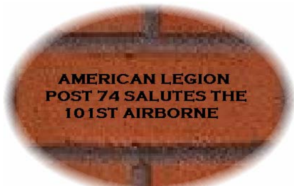
Sample Memorial Brick